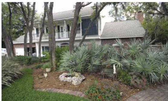
This residential landscape demonstrates partial lawn conversion where native plant beds replace a full front lawn, reducing irrigation requirements. The introduction of a pervious brick pathway allows runoff to percolate down instead of running off into storm drains or water bodies.